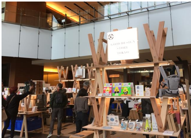
■POP UP STORE in 2017